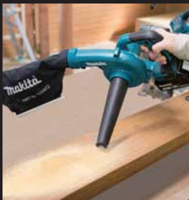
For vacuum use