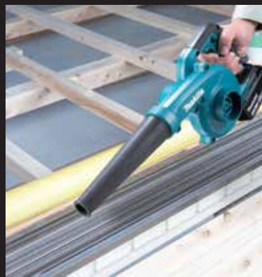
For blowing dust in the sash