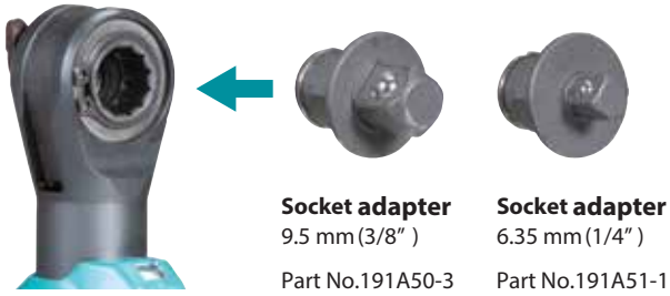
Socket adapter 9.5 mm (3/8") Part No.191A50-3