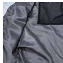
Antibacterial and deodorant lining