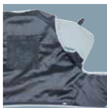
Air circulation inner