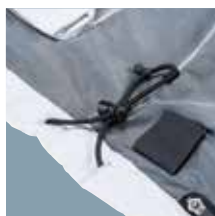
Drawcord on hem for adjustable fit