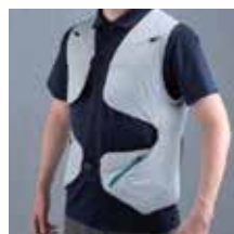
Clothing under the vest is seen, allowing user to wear over worker's uniform.