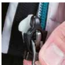
Insert supporting slider