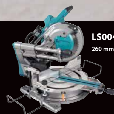
LS004G 260 mm (10-1/4")