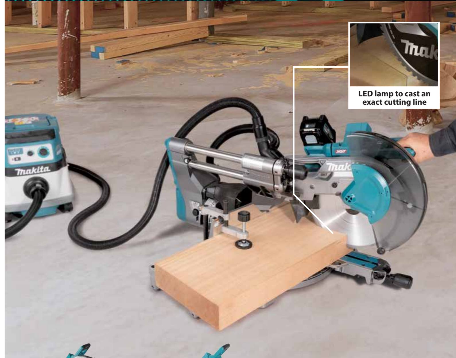
LED lamp to cast an exact cutting line