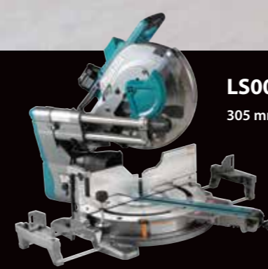
LS003G 305 mm (12")